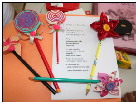
A poem, 'Let's Play With Words' with brightly decorated pencils for children to write their own poetry.