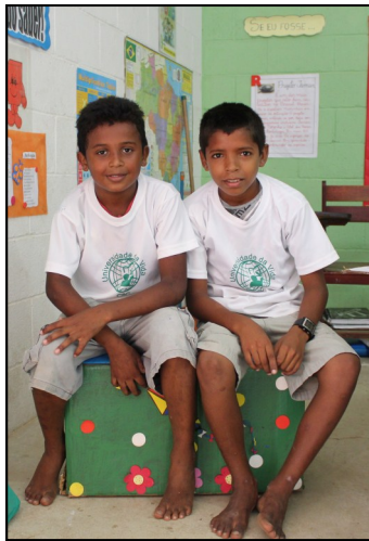
A padded bench made from a cardboard box re-enforced with plastic bottles.