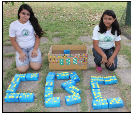
Dominoes made with milk cartons

As one child said: "We don't have anything to give her so we give her our help because she does such cool things for us."