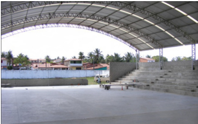
Seating for crowds and court for playing sports