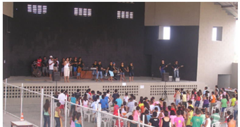
Stage for performances